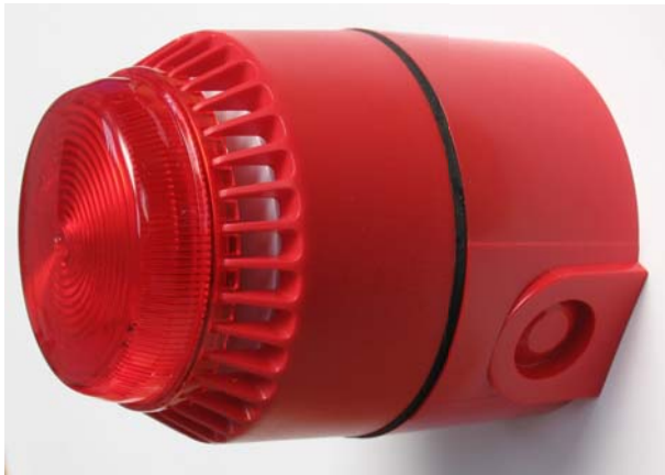
Flashni with deep base